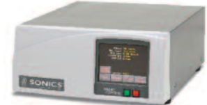
MSC SmartControl Power Supplies

Sonics' 40 kHz power supplies come in 2 versions, the MX Series, with standard keypad operation and the SmartControl (MSC) Series with full color touch screen controls. The features of the models are compared below.