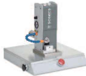
MWB40 Actuator on Integral Base