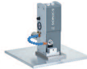
MWP40 Actuator on Plate