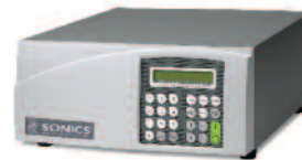
MX Series Power Supplies

MSC SmartControl with Time, Energy and Height-Based Weld Modes