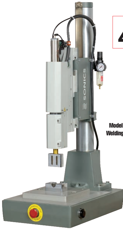
Model 4095 Welding Press