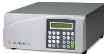
GX-Series Power Supply